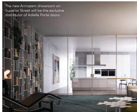
The new Armazem showroom on Superior Street will be the exclusive distributor of Adielle Porte doors.