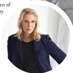
Victoria Hagan’s second book features exquisite second homes.